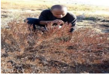
Dry season plant