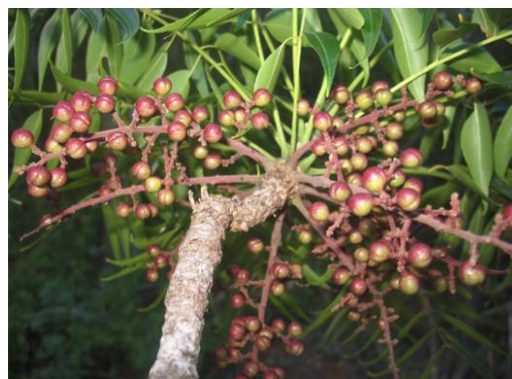
Figure 5. Zanthoxylum decaryi