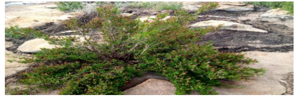
Wet season plant