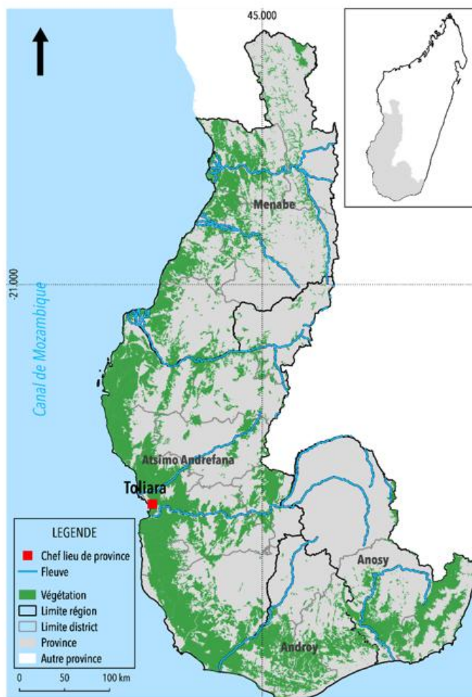
Figure 1. Study area

2.2. Ethno-botanical survey: Ethno-botanical surveys, based on direct questioning of anti-diabetic and anti-cancer medicinal plants, were carried out from June to July 2021 in the province of Toliara among healers, herbalists and, above all, villagers. The survey was carried out using a pre-established questionnaire form. The questions were asked in the local dialect, and varied according to the region where the survey was carried out. They covered socio-demographic data (age, sex, marital status, level of education), plants and organs used, as well as preparation and administration methods.