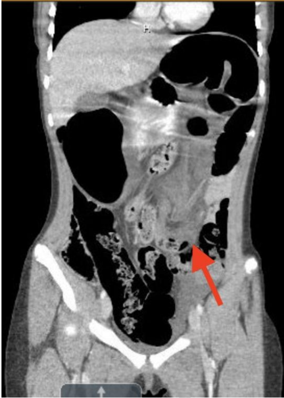
Figure 2- CTAP coronal view; Whirl Sign