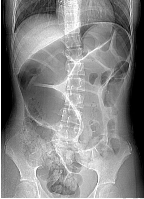
Figure 1, CT Abdomen and Pelvis with oral and IV contrast

Comment [H13]: Please include the information in the case presentation .