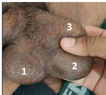
Fig-3 photographs showing three testicles