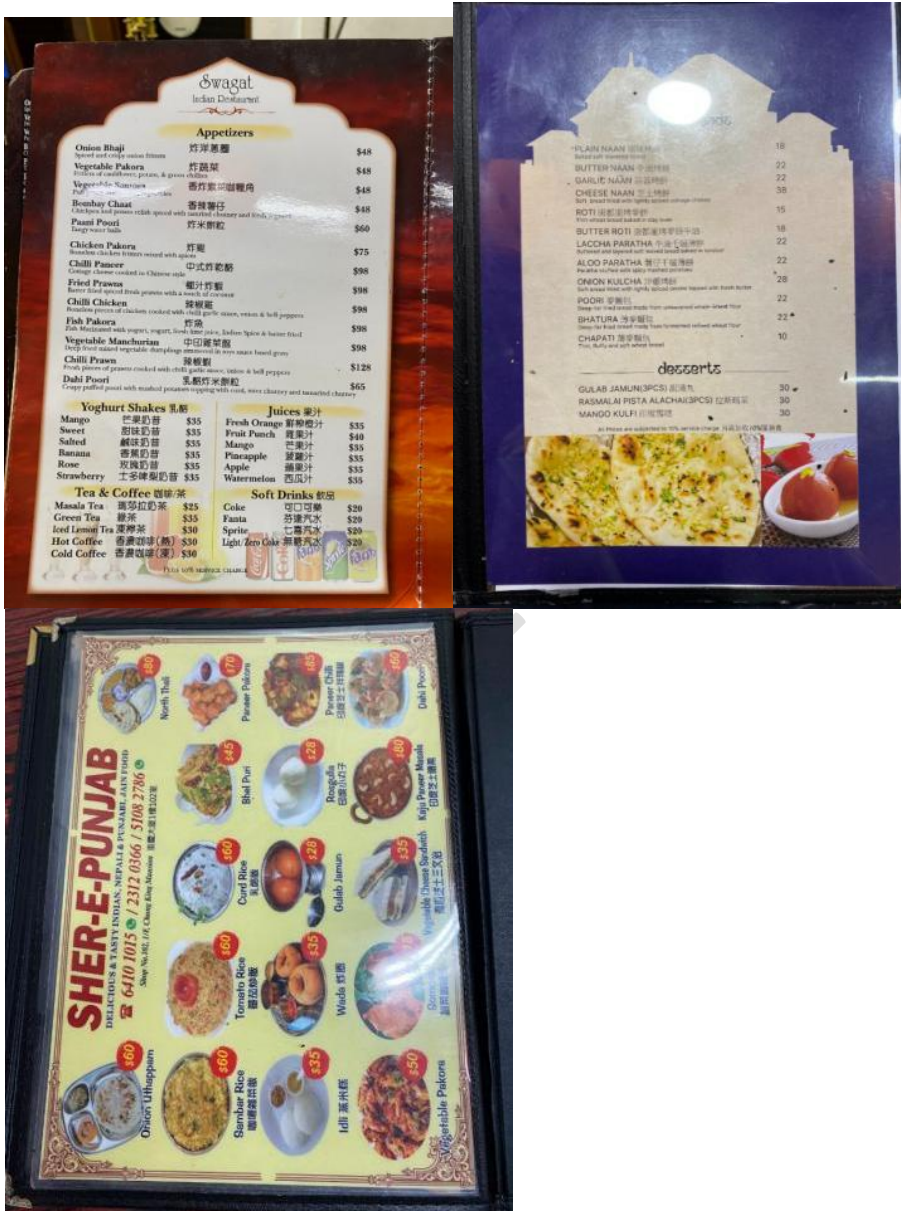
Fig 7,8,9. Menus with Chinese translation

the cooking methods or ingredients. Some food items e.g., ‘North Thali’ and ‘Bhei Puri’ (Fig 9) are not accompanied by the Chinese translation or written in pure English (Fig 10) probably due to the limited language proficiencies or no identical/equivalent term in Chinese. The shop owners match the items with the pictures to ensure easy recognition.