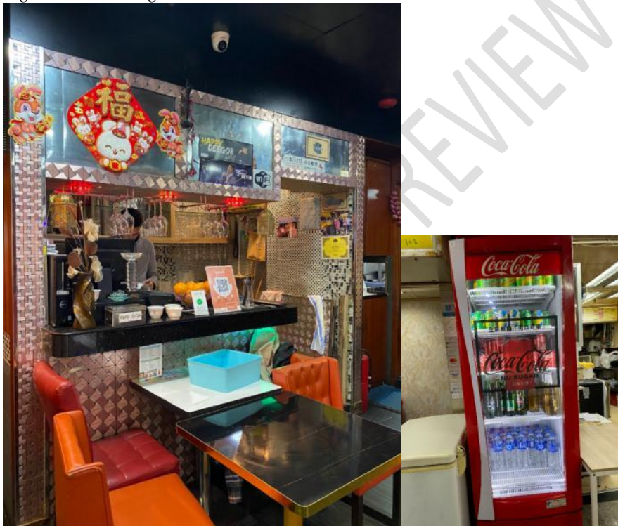
Fig 12,13 Inner settings in the restaurants