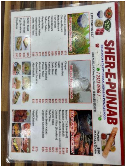
Fig 10. Menu in pure English

The restaurants usually do not include lots of Indian features in the inner settings. Owners try to avoid local visitors stereotyping the restaurant as Indian-specific. They may feel distanced from the unfamiliar culture and lower the likelihood of visiting. Instead, the inner design reflects the combination of various cultures. For example, the decorative banner ‘Happy Birthday’ (Fig 11), uses the tips box as a traditional British culture and the wine glass rack (Fig 12) as Western-liked. In addition, several shops use the ‘Cola fridge’ which is a signature item for many cha chaan teng (i.e., local restaurant in Hong Kong) and ‘Fai Chun’ (i.e., decorative banner to be hung up during Chinese New Year that means good luck) (Fig 12 and 13). They also use the ‘Slippery Floor’ and ‘No Liquor under 18’ signs in Chinese. As shown in the cashier, they accept different payments e.g., credit cards and WeChat Pay (i.e., a common payment method in China). Yet, they retain some Indian features, for instance, the lotus statue and incense burner. Indians treat lotus as a symbol of dignity and sanctity, which represents auspiciousness, peace and enlightenment while the incense burner relates to religious faith.