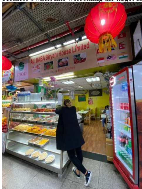
Fig 14. Fast Food Shops

Another possibility would be the indication of target consumers as the identity of the business owner, like welcoming the target audience by displaying their national flags.