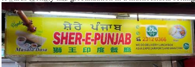
Fig 6. Restaurant Banner

Many restaurants in core districts of Hong Kong, including Tsim Sha Tsui where Chungking Mansions is located, are adopting Simplified Chinese to accommodate mainland visitors or immigrants. However, many leaflets in Chungking Mansions still use Traditional Chinese, reflecting a prioritization of identity at the city level versus the country level while the use of English creates an international image and attracts overseas consumers. This demonstrates the complex language needs and attitudes towards identity and globalization in a multicultural setting like Hong Kong.