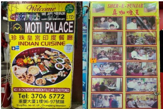
Fig 4,5 Restaurant Promotional Posters

Chinese titles usually have a larger font size with more exaggerated font styles to outline the words. For the restaurant ‘Khybet-Pass Mess Club’ (Fig 1), the size of the Chinese words is at least three times larger than the English names while for the restaurant ‘Tajmahal Club’ and ‘Monti Palace’ (Fig 2 and 4) place the Chinese words with the unique black and white highlight on the top of the design. For the slogans, most of them are Chinese only about the gimmicks— e.g., the pleasant environment, reasonable prices and delicious cuisines. As for graphics, the celebrities and customers are Hong Kong locals in general (Fig 5), for instance, the shop owner had taken a photo with ‘ERROR’ (i.e., a well-known male idol group in Hong Kong) (Fig 3). Regarding the conveyance of information, there is no full translation of both Chinese and English. Joe suggested that he target outsiders who have not been to Chungking Mansions, for example, the subtitles of ‘Contact number’ (Fig 1) and ‘Shop address’ (Fig 1 and 3) are written in Chinese only.