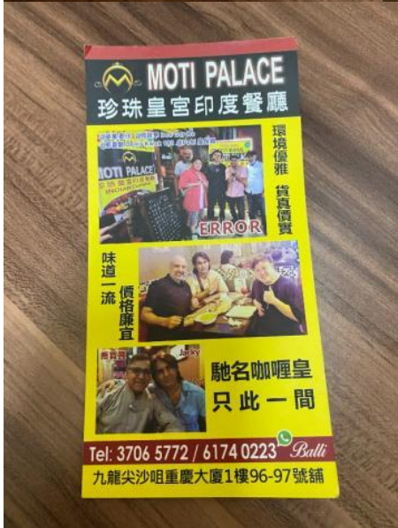
Fig 1,2,3. Restaurant Promotional Pamphlets