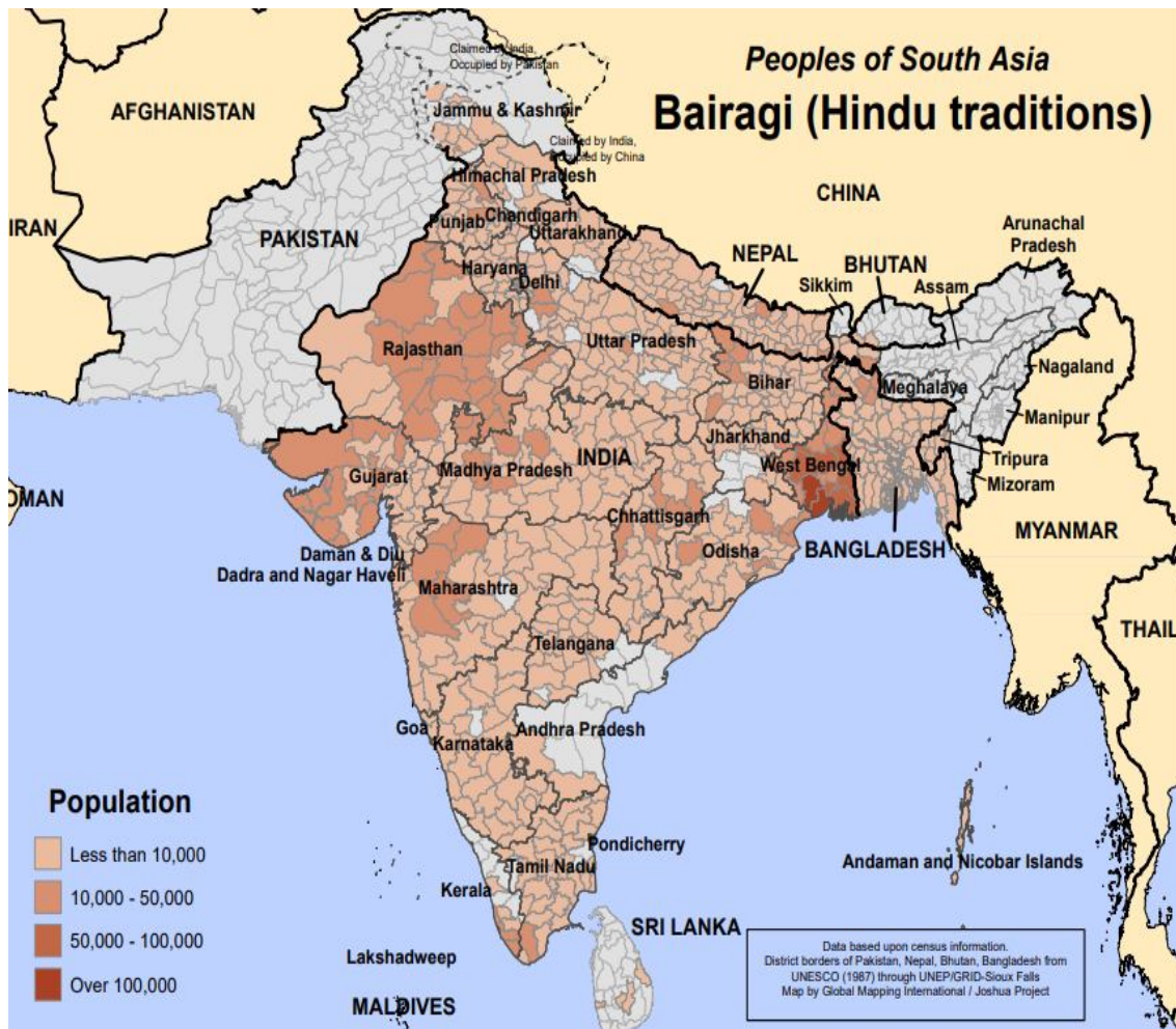
Image. 2 Distribution of Bairagi population in 1987, Data Source: Joshua Project