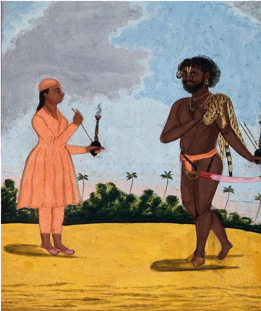
Image 1. A Vaishnavite or Bairagi Ascetic. Gouache,

Vaishnav are synonymous terms. In the oral history told by Bhatt's caste genealogist of Bairagis told the story that Bairagis are manasputra (human son) of Brahma who were worshiper of Vishnu. They were ascetics hence known as Bairagis as they had renounced the world. The story further tells that if all the sons of Brahma became ascetics than how the world progress, so Brahma asked Bairagis to marry. Few Bairagis started living a married life. Those who started household life known as Sansari Bairagis. Vaishnav Bairagi as sects consist of varied people from different strata, but Herbert Risley pointed out that Bairagis as caste had restricted connotation. Risley mentioned that caste claimed Chaitanya who lived in 17 th century as its founder in context of Bengal. But this can be contested as the Bairagis or Vaishnav united in 18 th century. Secondly Bairagis sect consist of teaching of Ramanuja who lived in 12 th century. There were no single founder Bairagis sect, but it was combined decision of leaders of varied Vishnuites sect to united as Bairagis to counter Shaivites. The caste norms gradually developed in the sect as would see in the later part of the paper.