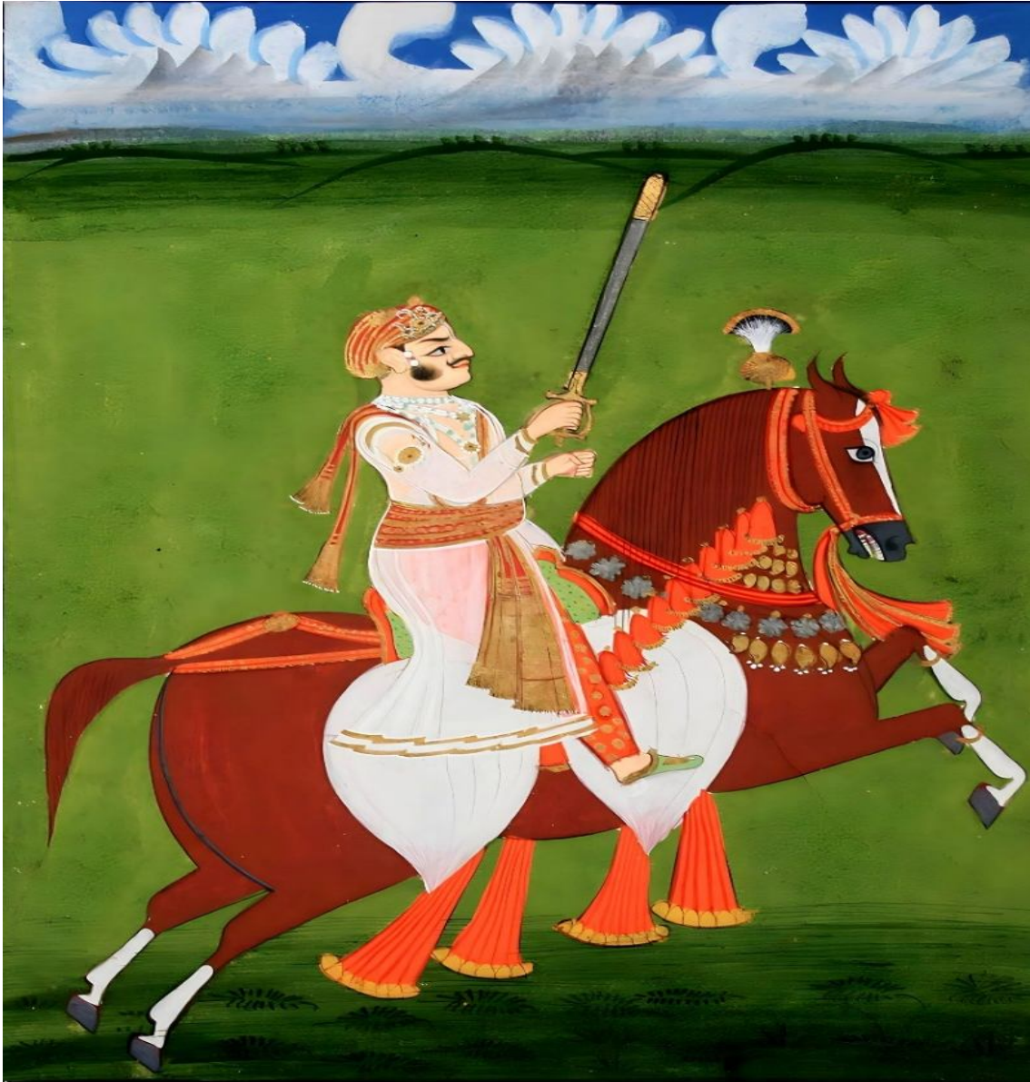
Image3.-Swami Balananda, who organized Bairagis into some fighting units at the Galta conference 1760, A.D.

Brahmapuri (Jaipur) during 1726, and in Jaipur around 1734, and the last one in Jaipur 1756. Accordingly, Vishnuites united as Chatur samprdaya and formed various Akhara and Ani i.e., fighting army (further details on Bairagis organization given latter section of the paper).