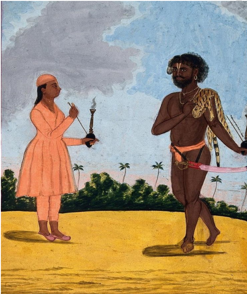
Image 1. A Vaishnavite or Bairagi Ascetic. Gouache