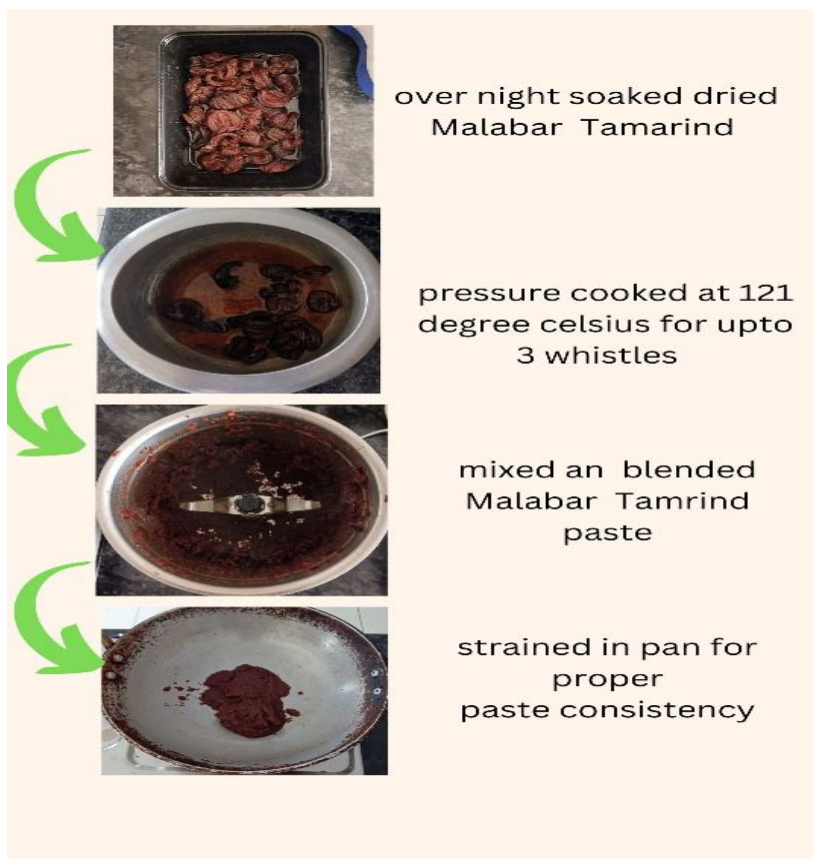
Figure 3 Representation of Malabar Tamarind paste preparation