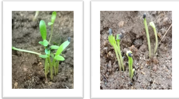
Picture 2. Juvenile phase of Dragon fruits