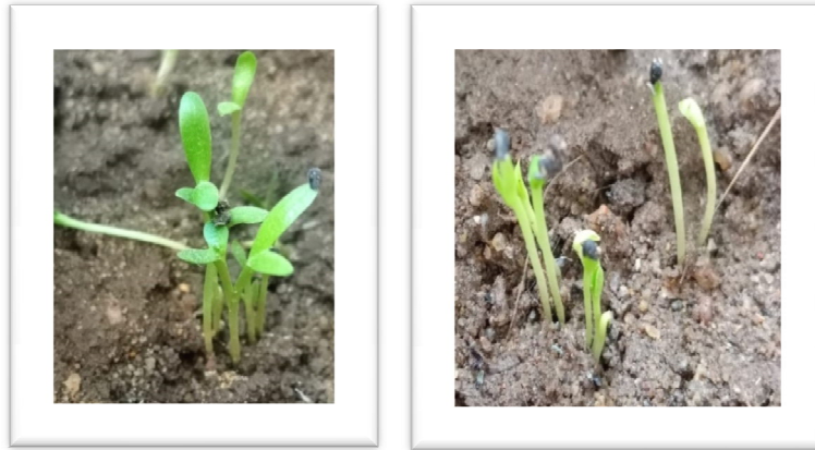
Picture 2. Juvenile phase of Dragon fruits