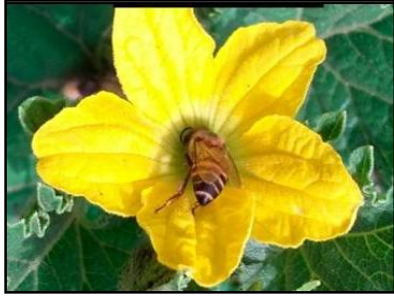
Apis cerana indica F.