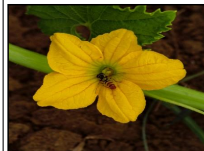
Sphaerophoria philanthus M.