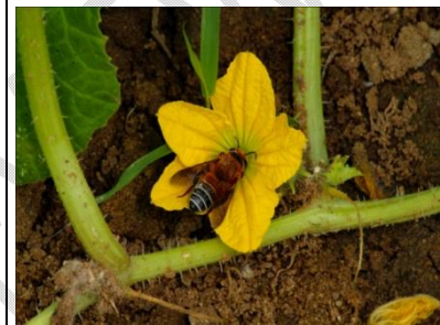
Mega Chile lanata F.