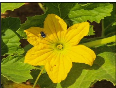
Musca domestica L.