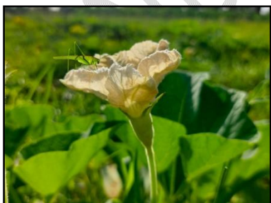
Phaneroptera falcata P.