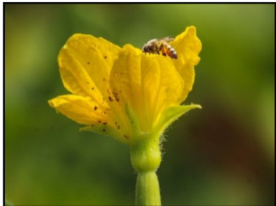
Apis mellifera L.