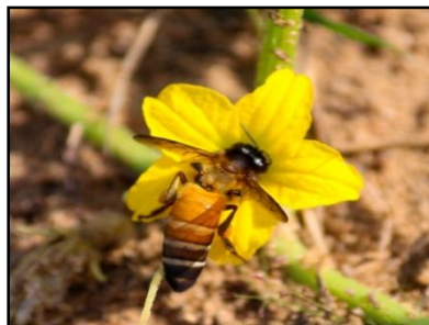
Apis dorsata F.