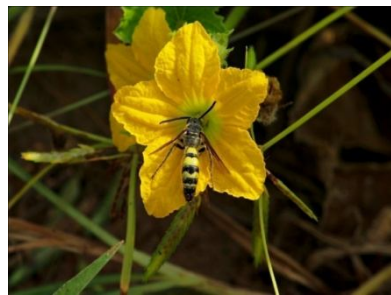
Dielis plumipes D.