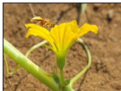
Polistes flavus C.