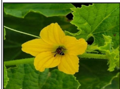
Apis florea F.