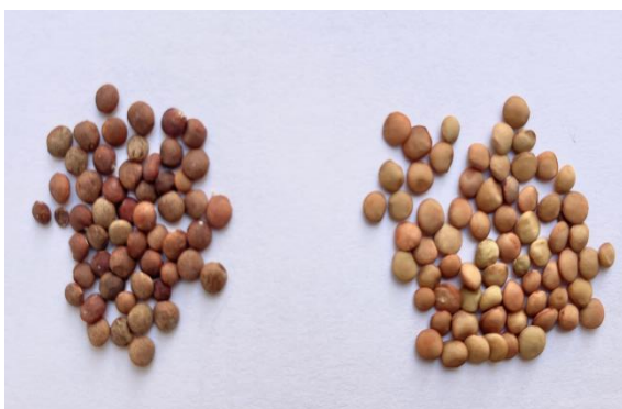
Fig 7: Seed Testa mottling