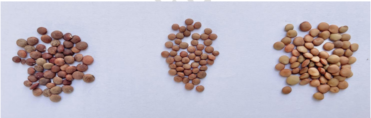
Fig 6: Seed Testa Colour