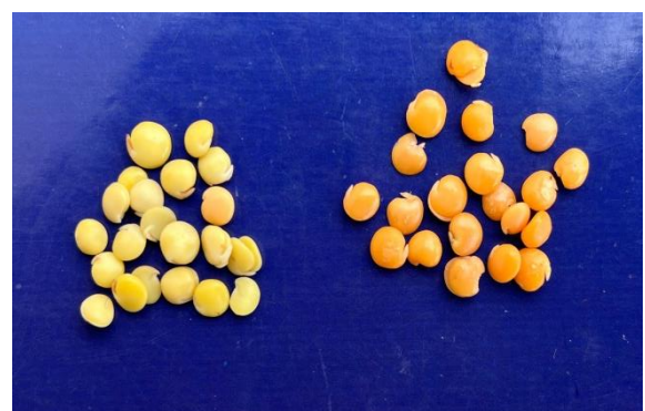
Fig 8: Cotyledon Colour