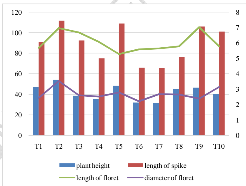
Fig. 1 Tuberose varietal influence on plant height, spike length, floret length and diameter of floret

Maximum loose flower yield per unit area were recorded by the variety Arka Suvasini followed by Arka Prajwal which was on par (2626.26 and 2125.50 gm -2 , respectively). Increased floret size and weight of individual florets leads to increased yield of loose flower. This is supported with the findings of Mahoviya (2003) in tuberose.