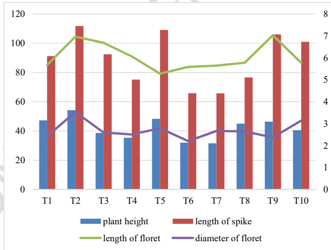
Fig. 1 Tuberose varietal influence on plant height, spike length, floret length and diameter of floret

Maximum loose flower yield per unit area were recorded by the variety Arka Suvasini followed by Arka Prajwal which was on par (2626.26 and 2125.50 gm -2 , respectively). Increased floret size and weight of individual florets leads to increased yield of loose flower. This is supported with the findings of Mahoviya (2003) in tuberose.