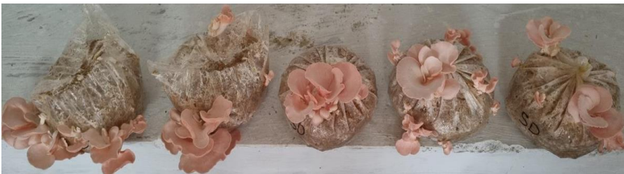
Plate 1 Mature fruiting body of Pleurotus djamor