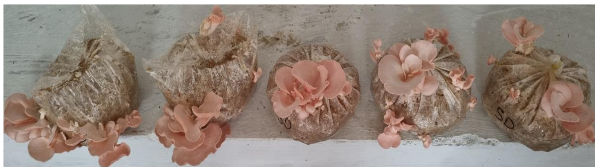
Plate 1 Mature fruiting body of Pleurotus djamor

The data presented in the table 2 and depicted in figure 2 revealed that yield (g) of pink oyster mushroom significantly increased in treatment T 3 - [paddy straw (500g) + sawdust (400g) + wheat bran(100g)] (163.23g) followed by T 4 - [paddy straw (500g) + cocopeat (400g) + wheat bran(100g)] (159.40g),T 5 - [paddy straw (500g) + cardboard (400g) + wheat bran (100g)] (152.0g), T 1 - [paddy straw (500g) + sugarcane bagasse (400g) + wheat bran (100g)] (147.57g), T 2 - [paddy straw(500g) + banana leaves (400g) + wheat bran(100g)] (146.27g) as compared to T 0 - (control) (120.60g).