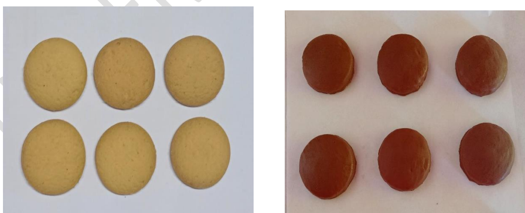
Fig.2. Base cookie and chocolate enrobed cookie

The surface colour characteristics of the base cookies and the enrobed cookies (Fig. 2) were given in Table 4. In this study, the L* value, representing lightness, showed a significant decrease in value (P < .05). Base cookies exhibited a higher L* value of 59.26 ± 0.62, indicating a pale, golden hue, whereas the enrobed cookies had a lower L* value of 37.02 ± 0.77, reflecting a darker, richer colour due to the chocolate coating. The a* value, associated with the red-green axis, decreased slightly from 14.88 ± 0.66 to 13.34 ± 0.36 due to the chocolate's brownish-red colour (P<.05). Furthermore, the b* value, representing the yellow-blue axis, also showed a significant decrease (P < .05) for enrobed cookies.