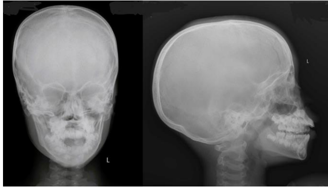
Figure 2 shows the anterior and lateral view of the skull X-ray

The patient was taken to the operating theatre for surgical drainage, during which approximately 320 ml of blood was evacuated and no drainage catheter was left in situ. However, sterile eye pads were applied to both eyes during the procedure to distribute pressure evenly and prevent blood accumulation in the unaffected right eye. Pressure was applied to the scalp contusion using a compression bandage to achieve hemostasis and prevent further bleeding after drainage. Postoperatively, the left periorbital swelling significantly reduced, and the left eye pad was kept in place for 12 hours, while the pad on the right eye was removed. The patient was placed on oral tranexamic acid at a dose of 15 mg/kg every 8 hours for three days.