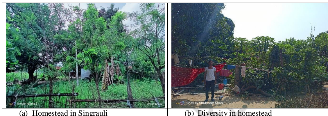
Figure 2: Homestead Forestry in the study area