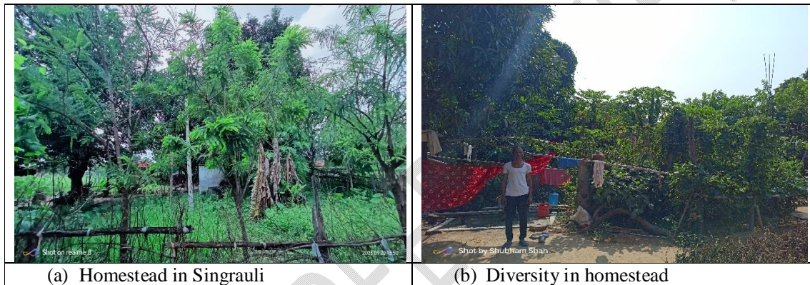
Figure 2: Homestead Forestry in the study area