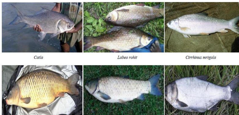
Fig 2. Major Cultivable Carps in Inland water bodies of Telangana.

gain traction among farmers, offering a sustainable way to increase fish yields while enhancing overall farm productivity.