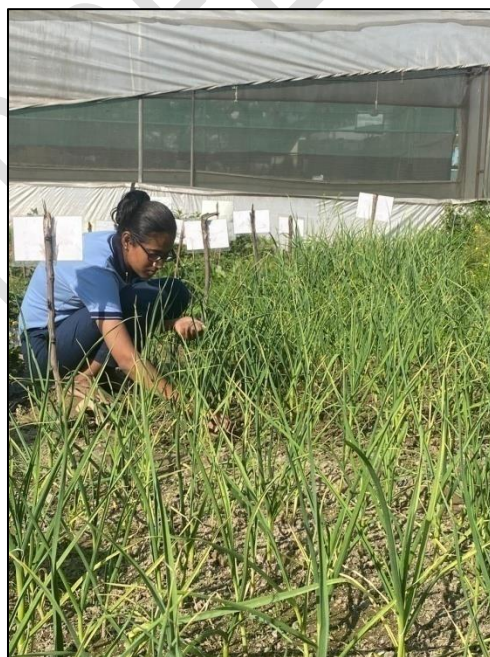
Plate 1. Pictorial view of garlic experimental field