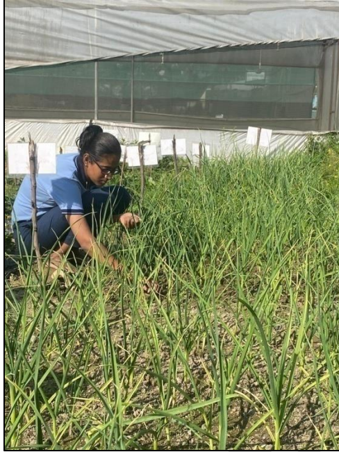
Plate 1. Pictorial view of garlic experimental field