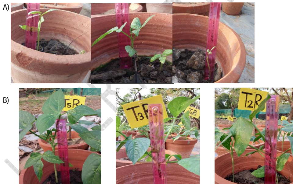
Figure 1. A) Cowpea grown in native Kaipadsoil B) Cowpea grown in Kaipad soil mixed with coirpith