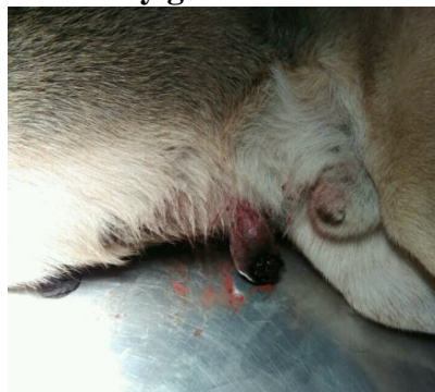
e. Ulcerative mammary