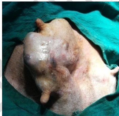
b. Mammary tumour involving both 4 th and 5 th mammary gland