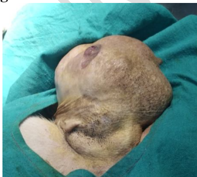
d. Intact mammary tumour