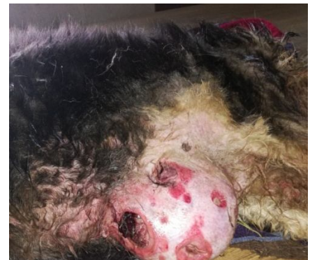
c. Ulcerative mammary tumour with maggots in female dog