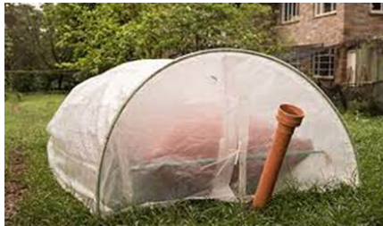
Figure 2. Flexi biodigester

The Flexi biogas system was used to digest the materials (Figure 2). Flexi biogas digester is moveable and elastic. It consists of a flexible digester bag, which is housed in a fabric tunnel. The tunnel serves as an insulator, which absorbs heat and maintains the temperature between 25 °C and 36 °C. The tunnel and the elastic bag increase the volume of gas production and decrease the retention time, ensuring a faster rate of fermentation and gas release. It is then piped via a PVC pipe connected to a stove for cooking. The flexi biogas digester does not require an agitator, and it is simply a 6 m x 3 m envelope made of PVC canvas and housed in a fabric tunnel. It is simple and easy to operate [52].