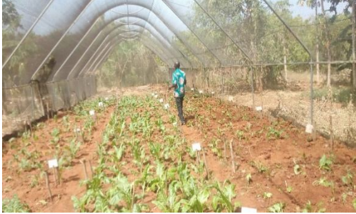
Figure 3. Swiss chard under shade net