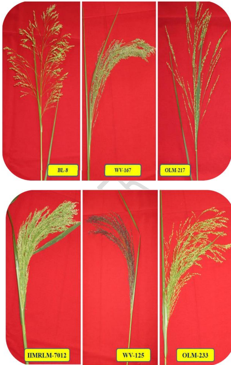
Plate 1. Phenotypic variation observed in inflorescence shape and colour in different Little millet genotypes