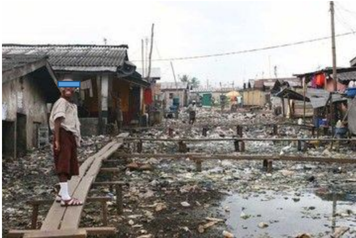
Fig. 1 A Picture of a slum in Ajegunle Lagos, Nigeria