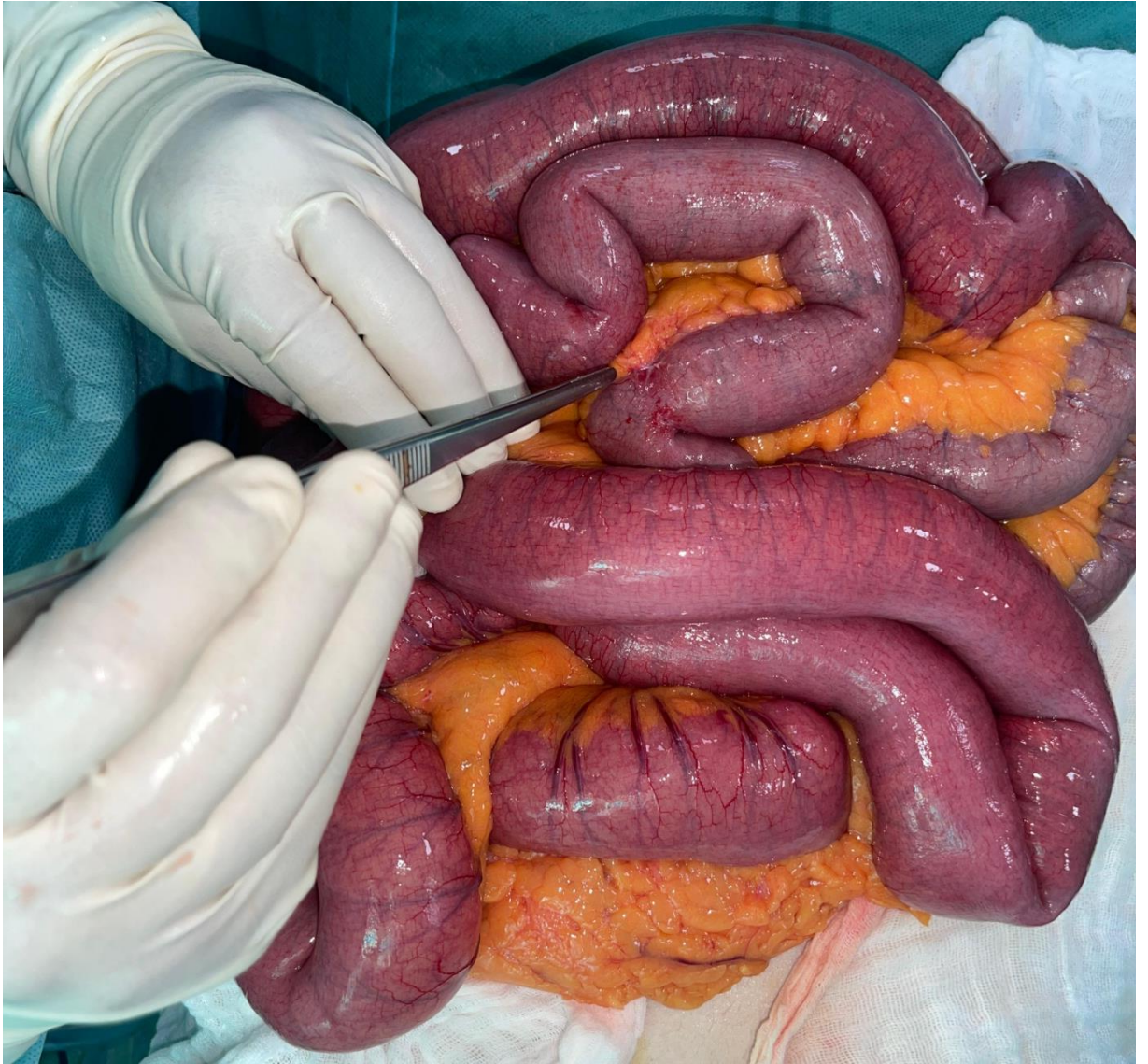
Figure3: distended cecum with transitional level