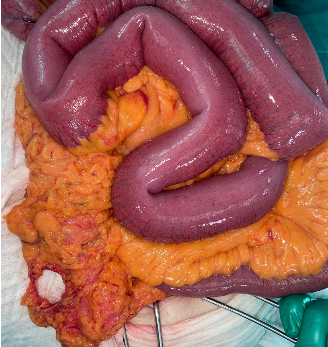
figure 4: the trans epiploic hernia orifice