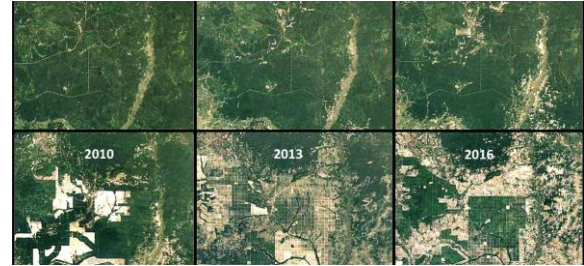
Fig 1: Satellite Imagery Comparison

AI-driven monitoring systems have shown substantial promise for environmental and public health improvements. Recent research by Subramaniam et al. (2022) has highlighted AI's capabilities in urban air quality monitoring, where AI models analyze real-time data from sensor networks to forecast pollution levels and pinpoint pollution sources. This allows for targeted intervention, reducing emissions and potentially lowering public health risks. Similar studies demonstrate how machine learning (ML) and IoT devices enable precise monitoring and predictive maintenance for HVAC systems, optimizing air quality and energy efficiency in buildings, which underscores AI's transformative potential for urban sustainability and policy-making.