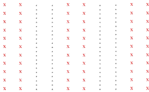
Fig 2: Sweet corn-based vegetable legume intercropping system in 2:2 row proportion