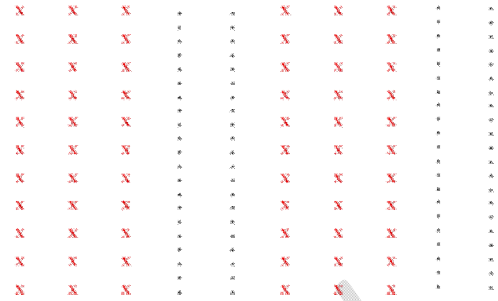
Fig 3: Sweet corn-based vegetable legume intercropping system in 3:2 row proportion