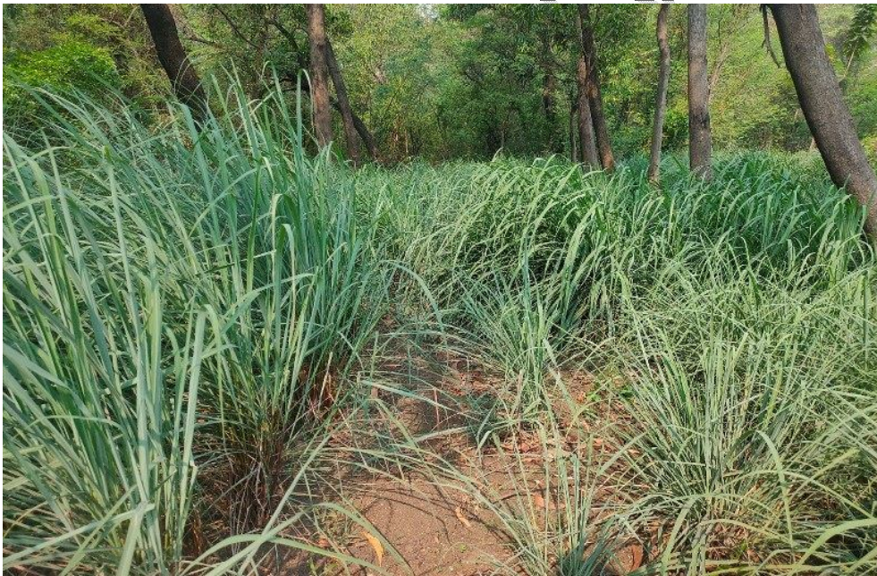
Plate 1: A view of field area during experimental period