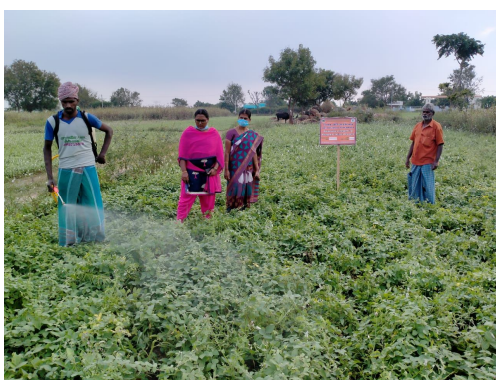
Picture 1. Demonstration of integrated crop management practices in horse gram