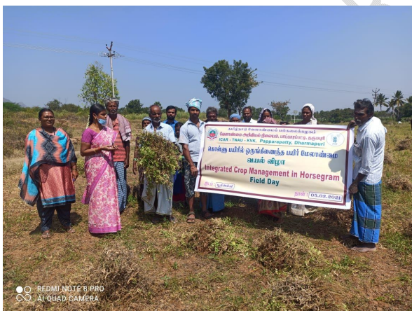
Picture 2. Field day on Horsegram variety CRIDA 18R

Success of the frontline demonstration was disseminated to the other farmers through conducting field day programme (Picture 2).