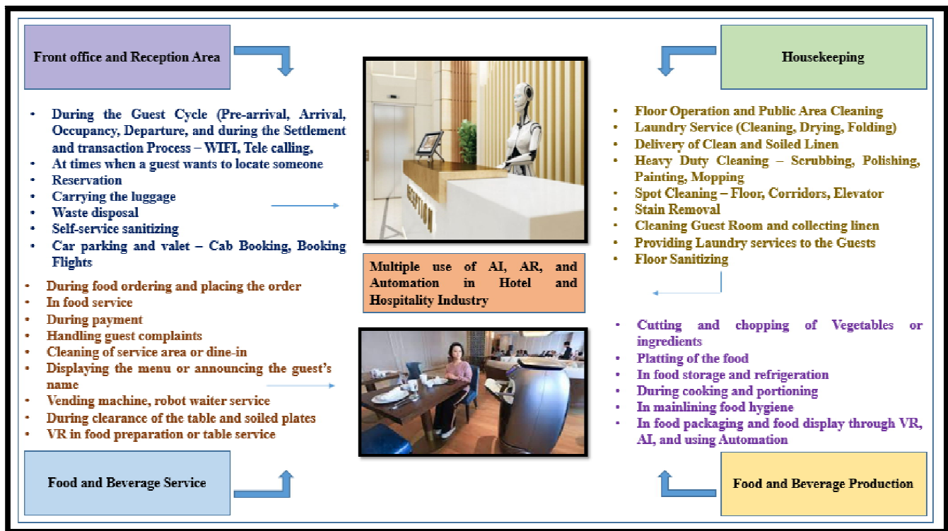
Figure: 2 Use of Artificial Intelligence in different sectors of Hotel and Hospitality Business

Interfaces at different hotels and restaurants provide customer customer-friendly experience based on programming and input. But beyond those application and program data, these third-generation interfaces can't fulfill the needs of the customer. Creating a recipe by service robot or automation is possible but to do the experiments based on available ingredients is only possible by a chef. In labor-intensive markets of the Third World countries including India, the cost of automation may not be viable as an alternative to cheap labor that can be exploited to the fullest. (Sandilyan & Pathak, 2022)