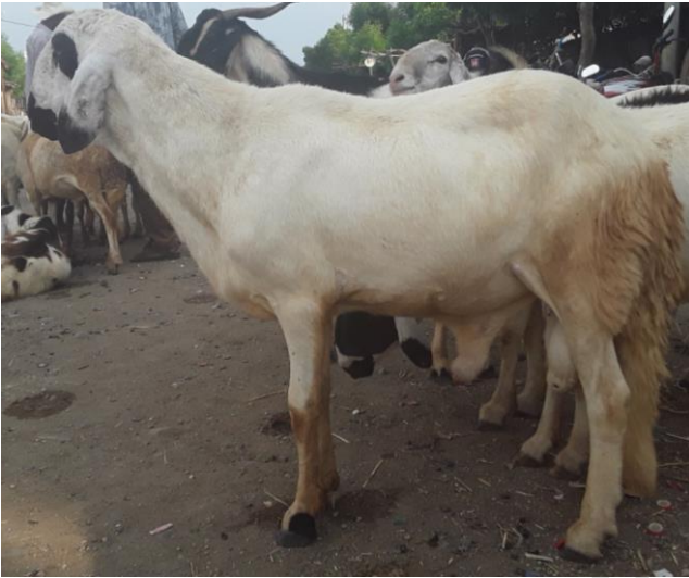
Figure 2 Sample Photo of Ram of Begait sheep (Adebay, Kafta Humera district)