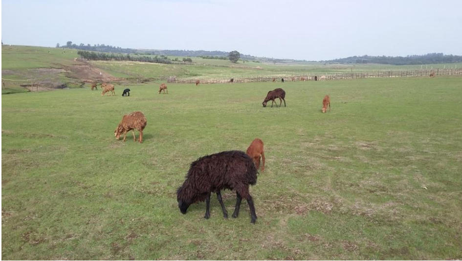
Figure 4 Sample Photo of Arado sheep (Chegar Kudo, Tsegede district)