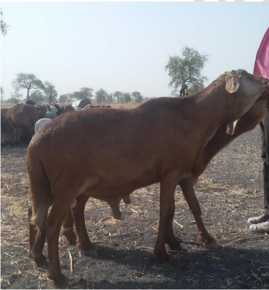
Figure 3 Sample Photo of Ram of Rutanna sheep (May Kadra, Kafta Humera district)