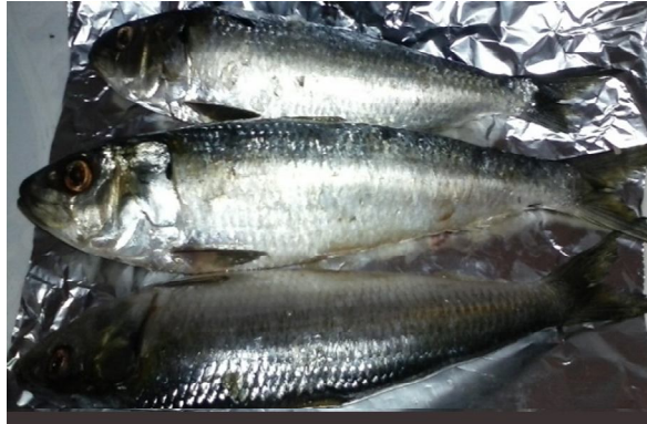
Fig. 1. Fresh herring fish ( Clupea harengus )