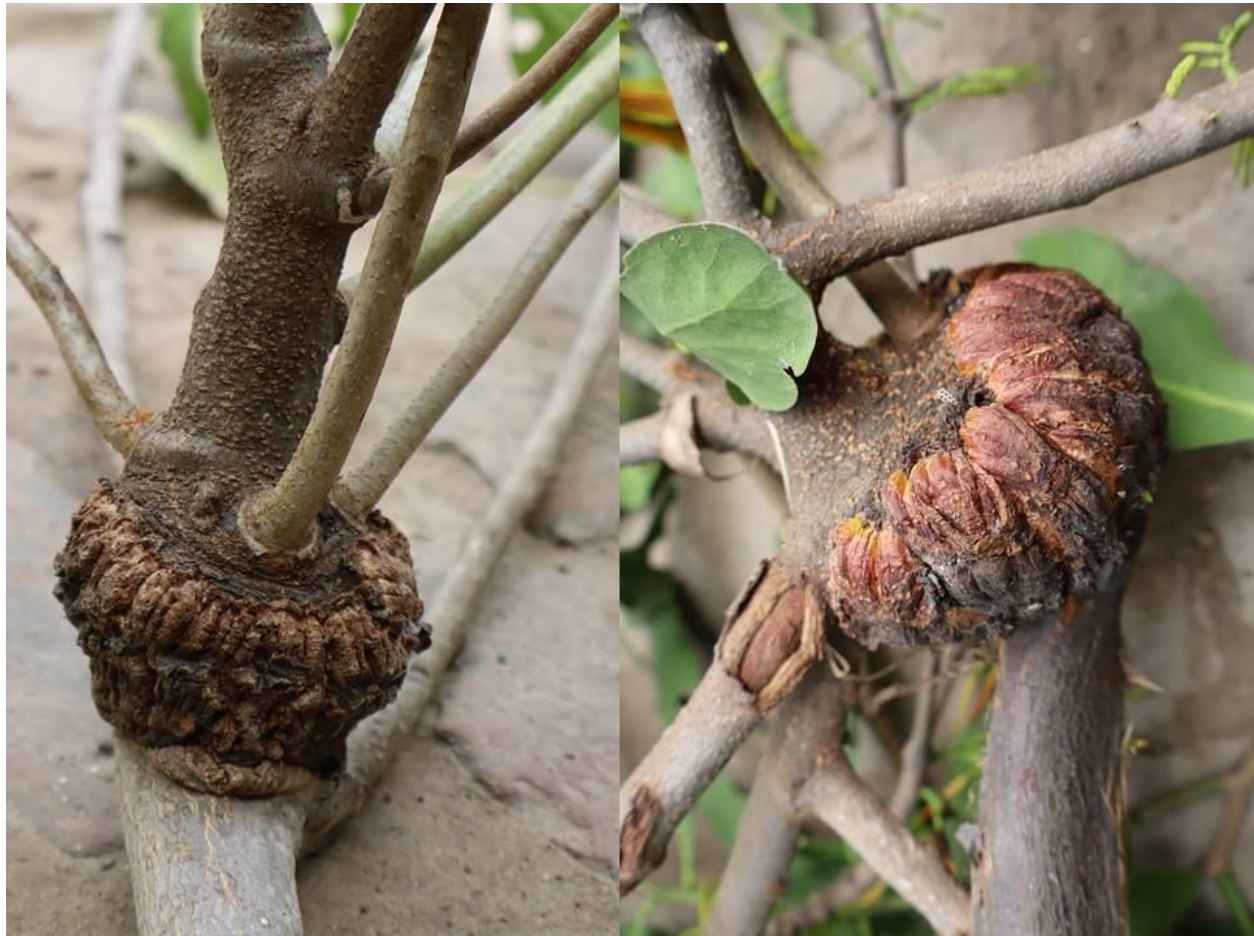
Fig. 2. Close view of galls in poplar (left) and melia (right) trees

Although the selection of host plants is entirely at random, experimental evidence indicates that this parasite has its own spectrum of hosts controlled by some factors one of which seems to be osmotic pressure relationships between the host and the parasite. D. falcata predominantly grows on the top of the host canopy to conduct photosynthesis [22]. The parasite is easily spotted on the branches of host trees as a dense cluster of small twigs bearing smooth, broad leaves and