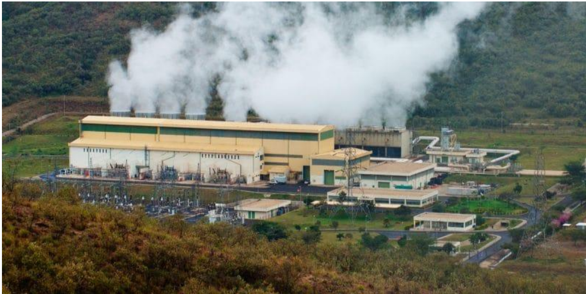
Figure 1. Menengai Geothermal power plant of 105 MWE giving Kenya overall Geothermal power of 672MWe