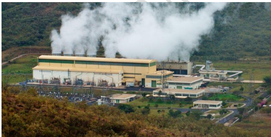
Figure 1. Geothermal power plant of 105 MWE giving Kenya overall Geothermal power of 672MWe

Kenya through M-Kopa was able to raise USD 80 million in 2017 in equity financing. This is as a result of attracting investment in the energy sector that spans for decades. What is important to note is the unit cost of installing 1KWe is US $1028.7 computed from the Menengai geothermal project. This is cheaper than most clean energy sources like solar which is US$760 per KW, Hydroelectricity at US$ 2600 per KW and Nuclear at US$4000-6000 per KW [41].