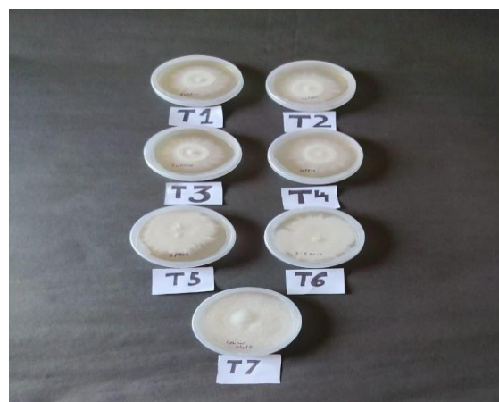
Fig. 2. Radial growth of Phytophthora infestans on PDA with different concentrations of Kresoxim methyl 44.3%

achieved by Sudisha et al. (2010) when Kresoxim methyl was used at 5 µg/ml as seed treatment and foliar spray in sunflower. However, Pithiya et al. (2024) reported the same chemical to be least effective in controlling the radial growth of Fusarium pallidoroseum in coriander compared to other systemic fungicides.