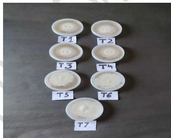
Fig. 02. Radial growth of Phytophthora infestans against Kresoxim methyl 44.3 SC % at different concentrations.