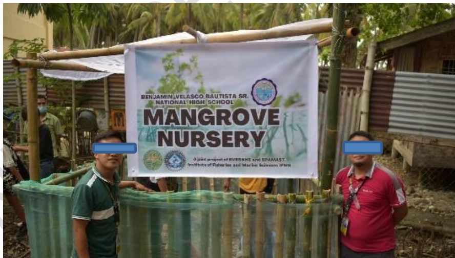
Figure 7. Established Community-Based Mangrove Nursery in BVBSNHS, Brgy. Mana, Malita, Davao Occidental

This initiative aims to promote the restoration and conservation of mangrove ecosystems, which are crucial for coastal protection, biodiversity, and local livelihoods [4]. The collaboration among academic institutions, community organizations, and local government exemplifies a holistic approach to environmental stewardship, ensuring community engagement and ownership of the project [18]. The nursery not only serves as a conservation measure but also provides educational opportunities for students and community members, fostering a deeper understanding of mangrove ecology and the importance of sustainable environmental practices [1].