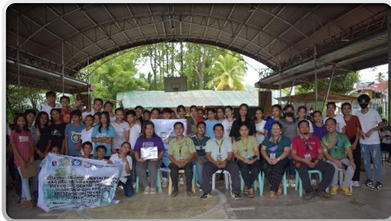
Figure 4. The CEP Trainees.

Significant findings from the CEP training revealed important changes and insights. Analysis of pre- and post-training data showed a 30% increase in the participants' ability to collect and utilize environmental data effectively. Additionally, 75% of participants observed shifts in local governance and community organization dynamics, highlighting the need for adaptable CRM strategies. Data on natural resource status showed notable variations in resource availability and usage patterns, while economic activity analysis indicated shifts in local livelihoods. These findings are crucial for developing sustainable CRM strategies that address both environmental and economic needs. Continuous monitoring and follow-up will be essential to assess the long-term impact and refine strategies for ongoing effectiveness.