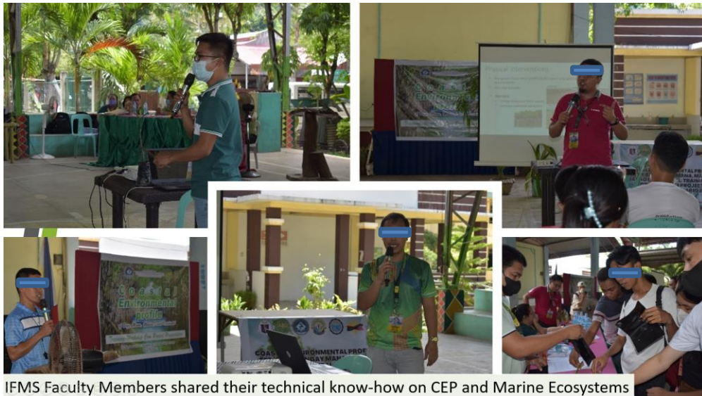
IFMS Faculty Members shared their technical know-how on CEP and Marine Ecosystems

practical knowledge assessments, highlighting the importance of effective management techniques for successful mangrove restoration. These outcomes suggest that the workshop and training significantly enhanced participants' capabilities in both understanding and implementing mangrove conservation efforts.