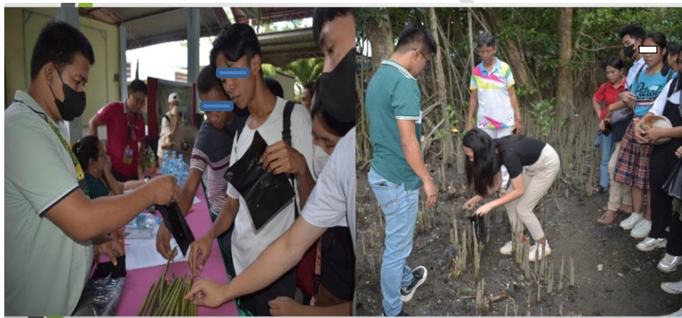
Figure 6. Mangrove species identification and actual planting.