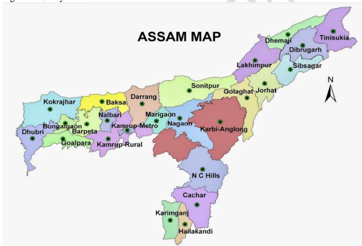
Figure 1 : Study area

The study was planned to estimate the expenditure on milk consumption pattern and preferences by different dietary groups in Kamrup district of Assam. The study was carried out in the Kamrup district of Assam using a multistage random sampling technique considered the both Metropolitan and rural areas. Within the Kamrup Metropolitan area, the localities of Bhangagarh and Kahilipara were selected, while Palashbari and Boko were chosen from the Kamrup Rural region. A total of 50 households were sampled from each locality, resulting in 200 respondents for the study. Primary data were collected from each household using a pre-structured schedule through a personal interview method conducted between February to May in the last year 2024.