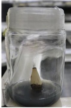
T 12 - Minimum browning