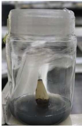
T 12 - Minimum browning