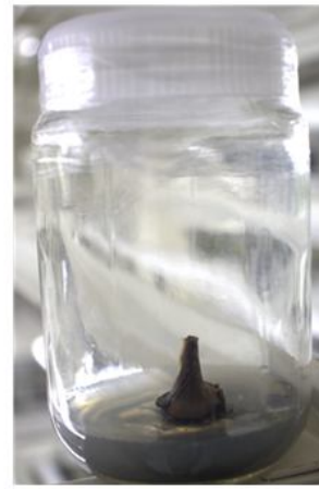
T 1 - Maximum browning