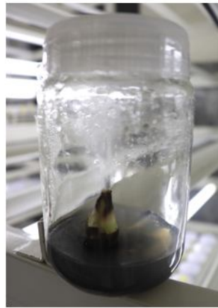
T 19 - Medium browning