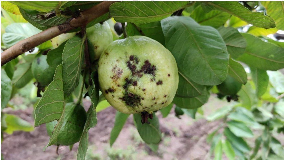
Plate 4: Infestation on fruit caused by tea mosquito bug