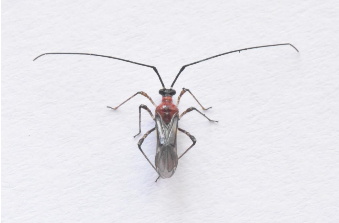
Plate 1: Adult tea mosquito bug, Helopeltis antonii Signoret