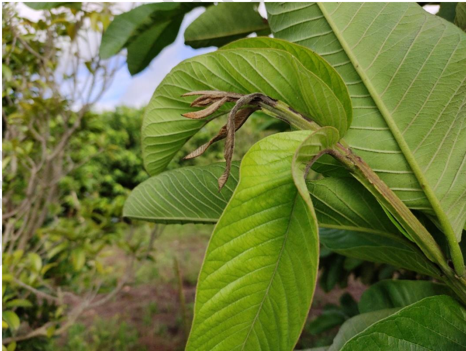
Plate 2: Drying of twigs due to tea mosquito bug