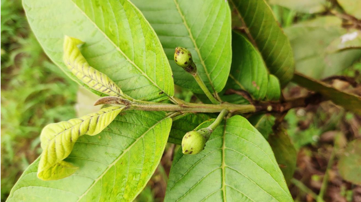
Plate 3: Flower buds affected by tea mosquito bug