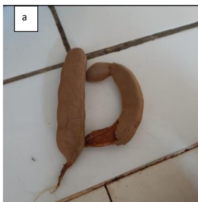
a-Fresh Tamarind Fruits

The plant material used in our study consisted of fresh and fermented tamarind collected from various markets in the cities of Abidjan and Korhogo.