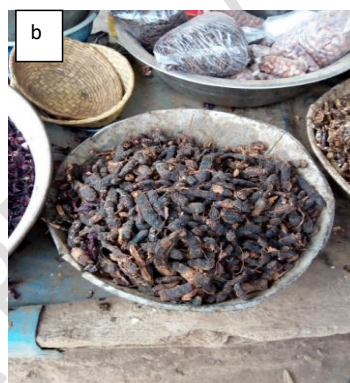
b- Fermented Tamarind Fruits