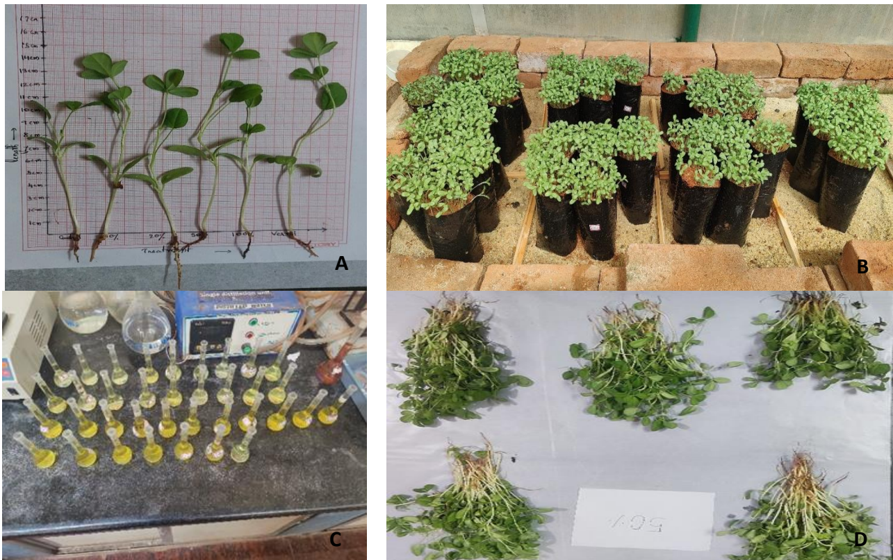
Fig 3: A. Germinated T. foenum seedlings after 4 weeks period; B. Growth of T. foenum in different concentrations of bat guano after 4 weeks period; C. Soil sample analysis; D. T. foenum plant samples before NPK analysis