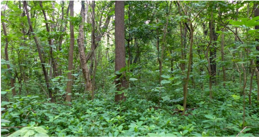
Fig 1: Amendment (Bat Guano) collection site in forest area of Institute of Wood Science and Technology, Bangalore