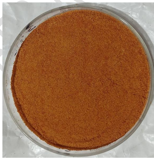
Dried Pulp at 75°C