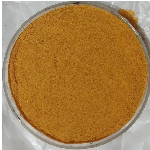
Dried Pulp at 55°C