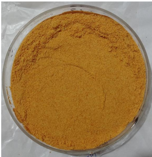
Dried Pulp at 65°C