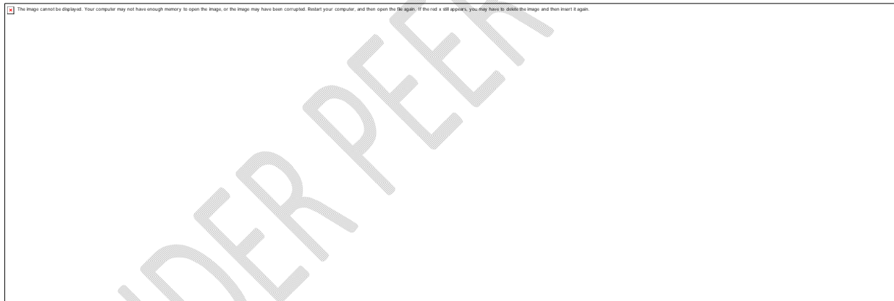
Figure 2: Fitted Structural Model using R Package SEMinR.

The total effect of ethical leadership behavior to teachers' motivation is positive and significant (0.590, [0.479, 0.742]) as depicted in Table 6b or calculated ( 0.239 \times 0.629 + 0.44 = 0.590 ) from Figure 1. This implies the ethical leadership has positive influence on the teachers' motivation. Hence hypothesis H a is supported.