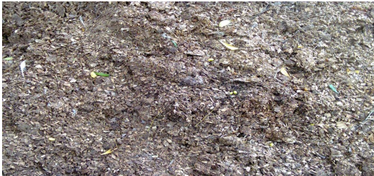
Fig 2 Poultry litter

dressing percentage of 53.6%, compared to 49.9% for the control group. These findings suggest that poultry litter can enhance beef production when incorporated into cattle diets. However, despite the advantages of using poultry litter in livestock feed, there are concerns about its safety. Sall, Norman, and Featherstone (2002) highlighted the risk of mad cow disease (Bovine Spongiform Encephalopathy) when poultry litter, which may contain rendered tissues from ruminants, is fed to cattle. Poultry litter can also harbor bacteria such as Campylobacter , Salmonella , and E. coli , posing potential health risks to humans if these pathogens are transmitted through the food chain. In addition to pathogens, poultry litter may contain residues of veterinary drugs, heavy metals, and foreign objects like rocks or glass, necessitating strict treatment and monitoring before its use as livestock feed.