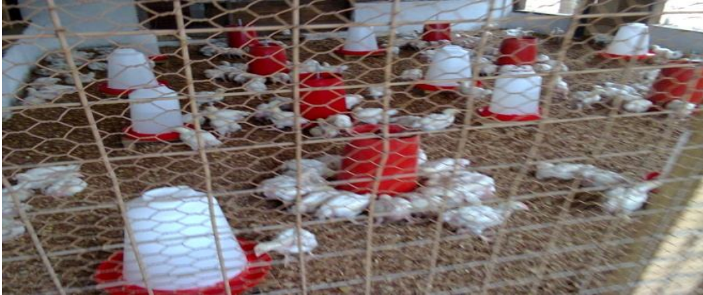
Fig 1 A poultry farm showing birds in a deep litter system.

The litter is high in protein, with crude protein levels reaching up to 31%, making it a viable alternative to conventional feed ingredients (Bernejee, 1996). Additionally, poultry litter is a rich source of essential minerals like calcium and phosphorus, which further enhances its value as animal feed (McClure et al., 1978). Although it contains pathogens, when carefully treated, poultry litter can be made free of harmful microorganisms, allowing its safe use as a feed supplement (Bernejee, 1996).